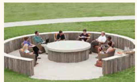
EVENT HOUSE FIREPIT