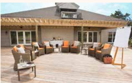
EVENT HOUSE DECK

Located on the Soundside with floor to ceiling windows, Kimball's Kitchen offers glorious views of the Currituck Sound. The exhibit style kitchen makes this a spectacular venue from November – April for events up to 60 people.