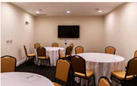
EVENT HOUSE AUSTIN ROOM

Located on the Soundside with floor to ceiling windows, Kimball's Kitchen offers glorious views of the Currituck Sound. The exhibit style kitchen makes this a spectacular venue from November – April for events up to 60 people.