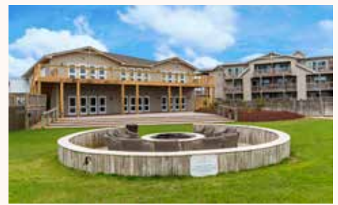
EVENT HOUSE FIREPIT