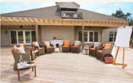
EVENT HOUSE DECK

Located on the Soundside with floor to ceiling windows, Kimball's Kitchen offers glorious views of the Currituck Sound. The exhibit style kitchen makes this a spectacular venue from November - April for events up to 60 people.