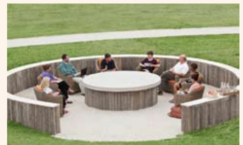
EVENT HOUSE FIREPIT